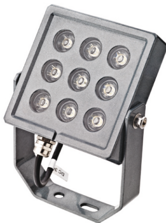
SPL100S, 24 VDC