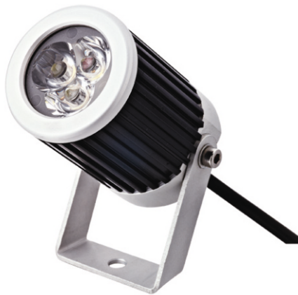
SPL45, 12 VDC