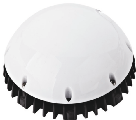
ABL120C, 24 VDC