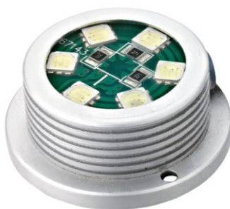
ABL42, 24 VDC