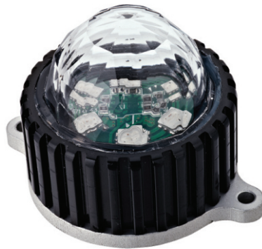
ABL45C, 24 VDC