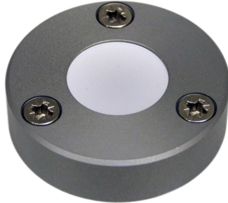
ABL45SL, 24 VDC