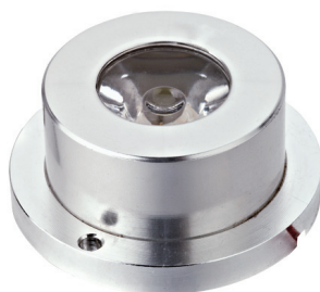
ABS42, 3.7 VDC