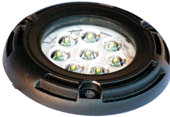
ABS76, 24 VDC