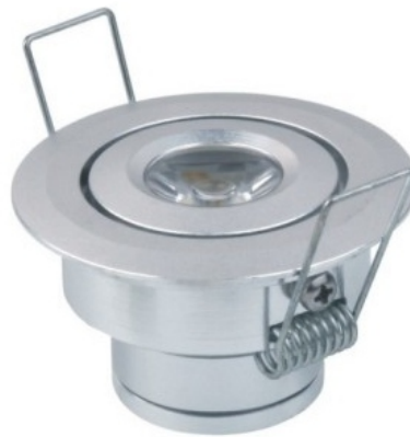
Panel mounted LED spot EBS52, 12/24 VDC