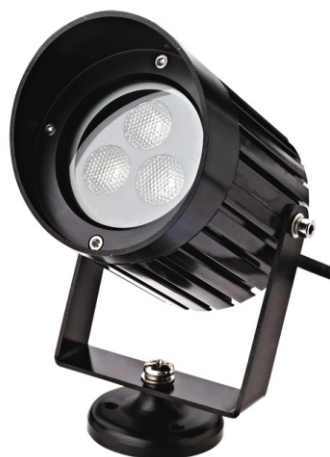
SPL76, 12/24 VDC